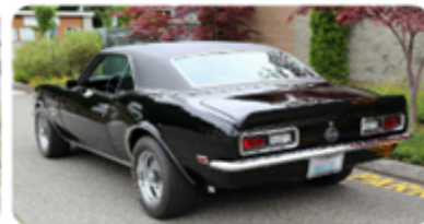
Rear ¾ Driver Side