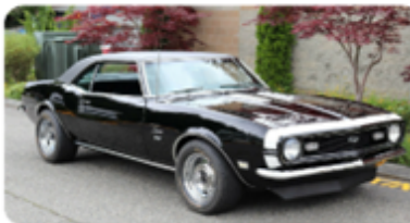
Front ¾ Passenger Side