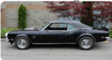
Driver Side View