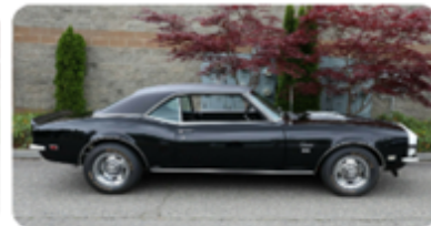
Passenger Side View