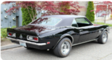
Rear ¾ Passenger Side