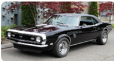
Front ¾ Driver Side