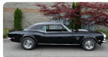
Passenger Side View