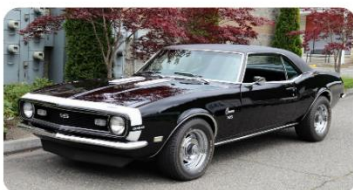
Front ¾ Driver Side