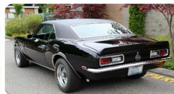
Rear ¾ Driver Side