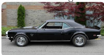
Driver Side View