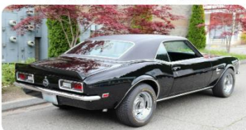
Rear ¾ Passenger Side