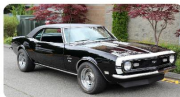
Front ¾ Passenger Side