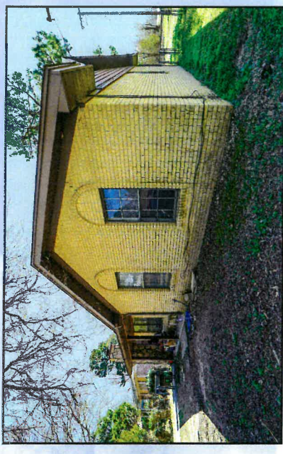
Property #3 ~ 6500 Whippoorwill Ln. 3BR/ 2BA ~ Rented $652/ Mo.