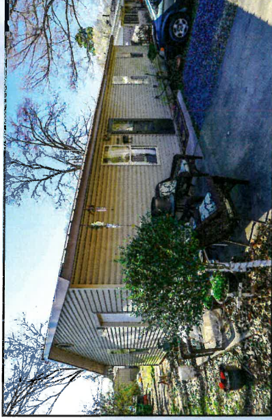
Property #2 ~ 6600 Stonehedge Rd. 4BR/ 2BA ~ Rented $700/ Mo.