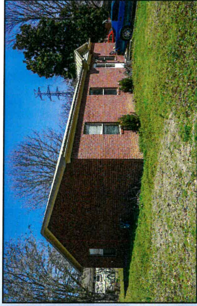
Property #1 ~ 6501 Farmstead Dr. 4BR/ 2BA ~ Rented $800/ Mo.

11400 Willow Beach Road North Little Rock, Arkansas 72117